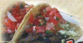
Taco de carne