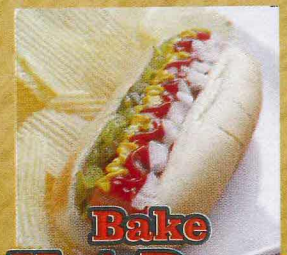
Bake Hot Dogs