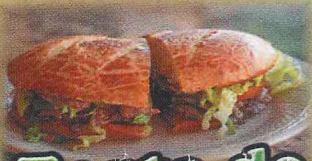
Torta de carne