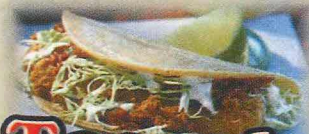
Taco de pescado