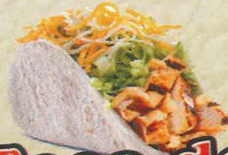
Taco de pollo